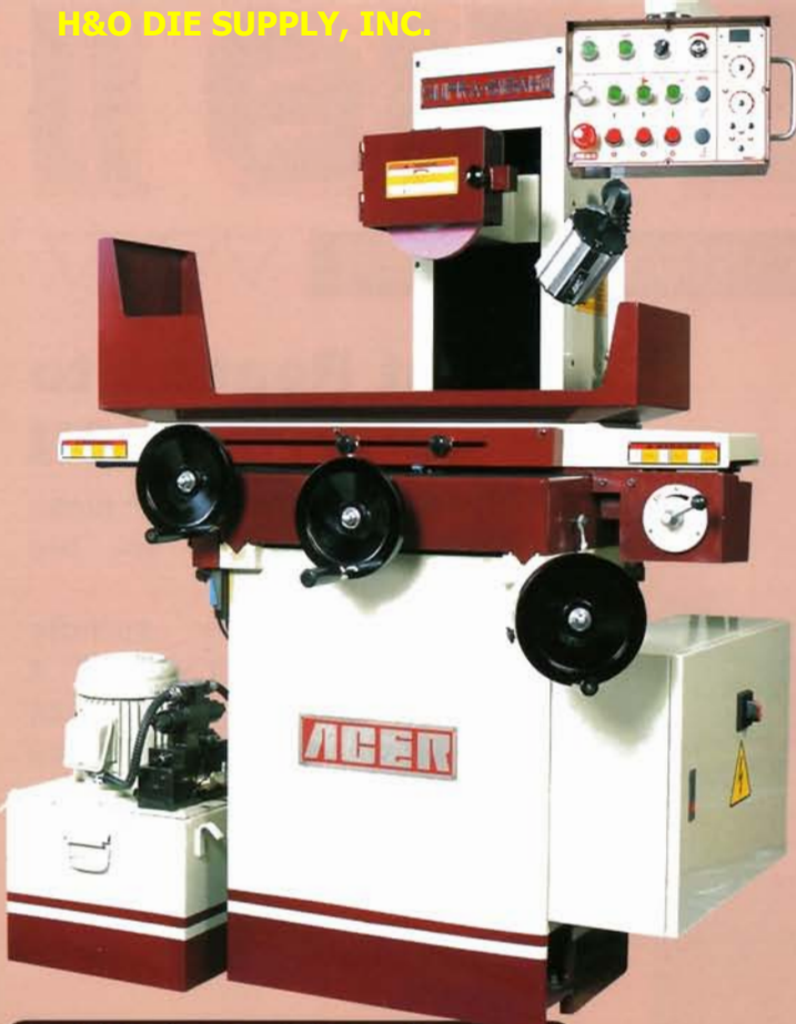
SUPRA 618 II AH